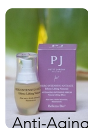
Anti-Aging Intensive Serum