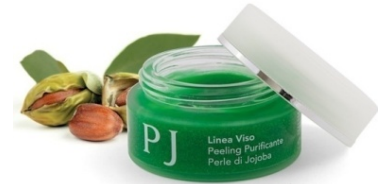
Purifying Peeling With Jojoba Pearls