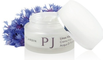
Face Night Cream With Cornflower Water