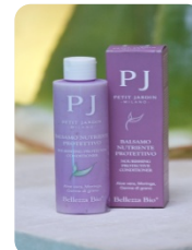
Nourishing & Protective Conditioner