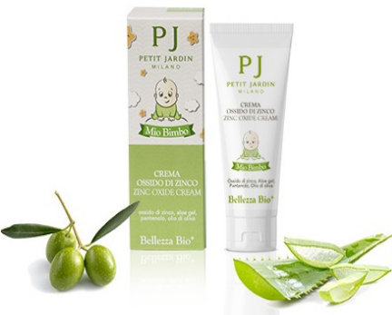
Zinc Oxide Cream

Its formula has a protective, regenerating and nutrient properties.