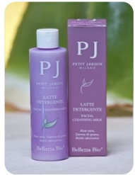
Anti-Aging Body Cream