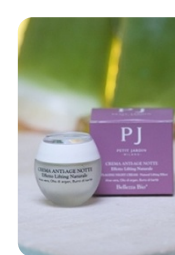
Anti-Age Night Cream