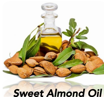
Sweet Almond Oil