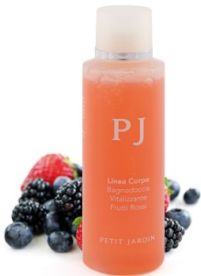
Revitalizing Shower Gel With Red Fruits