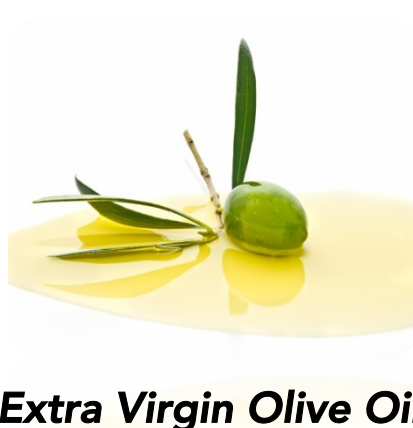
Extra Virgin Olive Oil