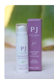
Eye Contour Gel