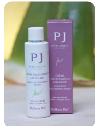
Cellulite Treatment Cream