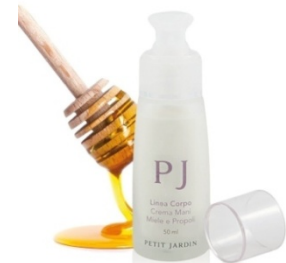
Hand Cream With Honey And Propolis