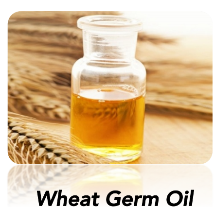
Wheat Germ Oil