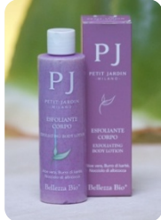
Exfoliating Body Lotion