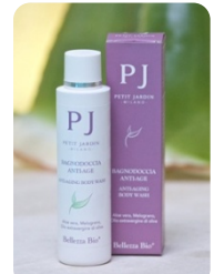
Anti-Aging Body Wash