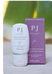
Anti-Aging Hand Legs Relaxing Cream