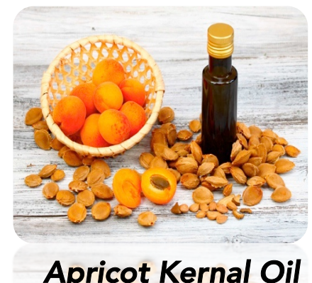
Apricot Kernel Oil www.petitjardinmilano.com