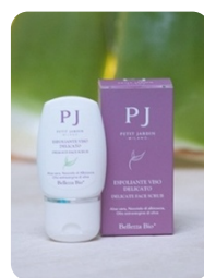
Delicate Face Scrub