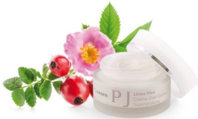
Super Hydrating Day face Cream