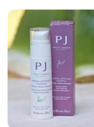
Anti-Age Day Cream