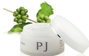
Anti-Cellulite Cream With Green Coffee