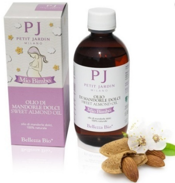
Sweet Almond Oil

This product is a valuable aid during pregnancy & breast feeding.