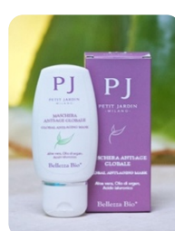
Global Anti-Aging Mask