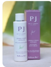
Gentle & Protective Shampoo