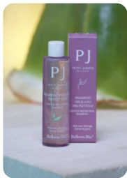
Facial Cleansing Milk