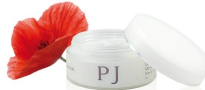
Velvet Mousse With Lotus Flower And poppy