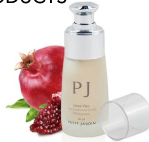
Eye Contour Gel With Pomegranate