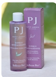
Revitalizing Tonic Lotion